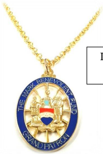
Ladies Grand Patron worn as a Pendant