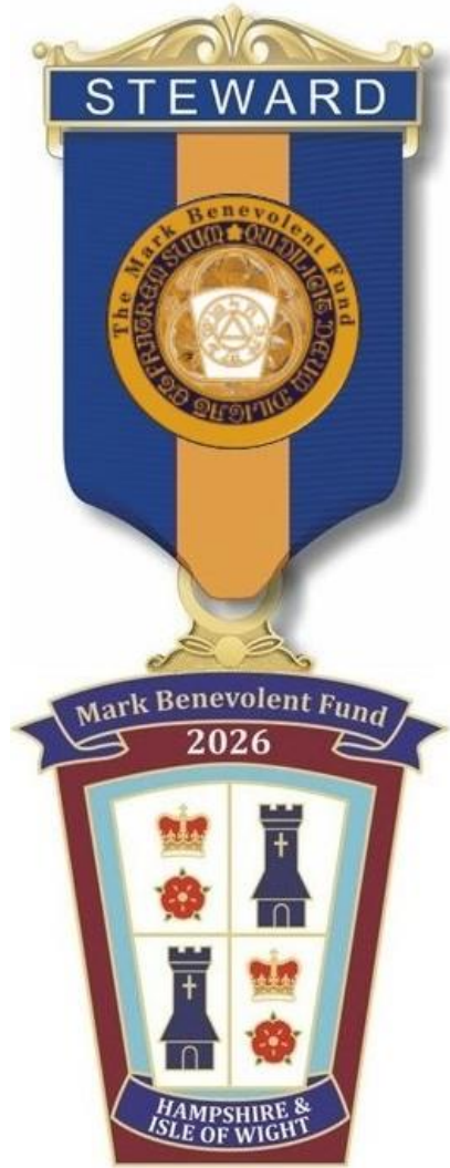
158 th M.B.F. Festival Stewards Jewel