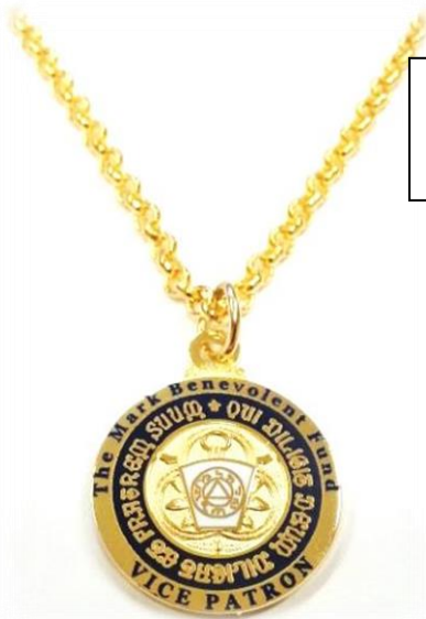
Ladies Vice-Patron worn as a Pendant