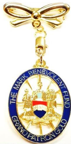
Ladies Grand Patron Gold worn as a Brooch