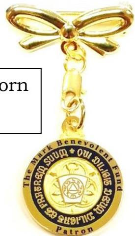
Ladies Patron worn as a Brooch