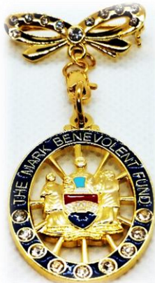
Ladies Grand Patron Diamond